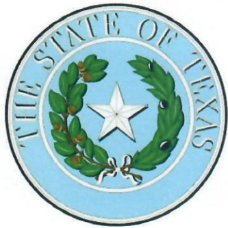
GREG ABBOTT, GOVERNOR OF TEXAS